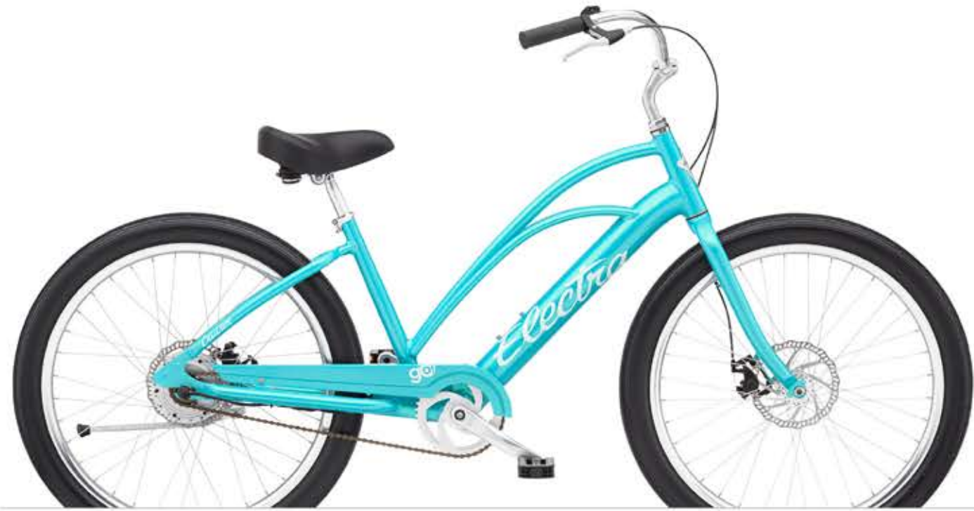
CRUISER GO! STEP-THRU / BORA BORA BLUE / SINGLE-SPEED / 5272068