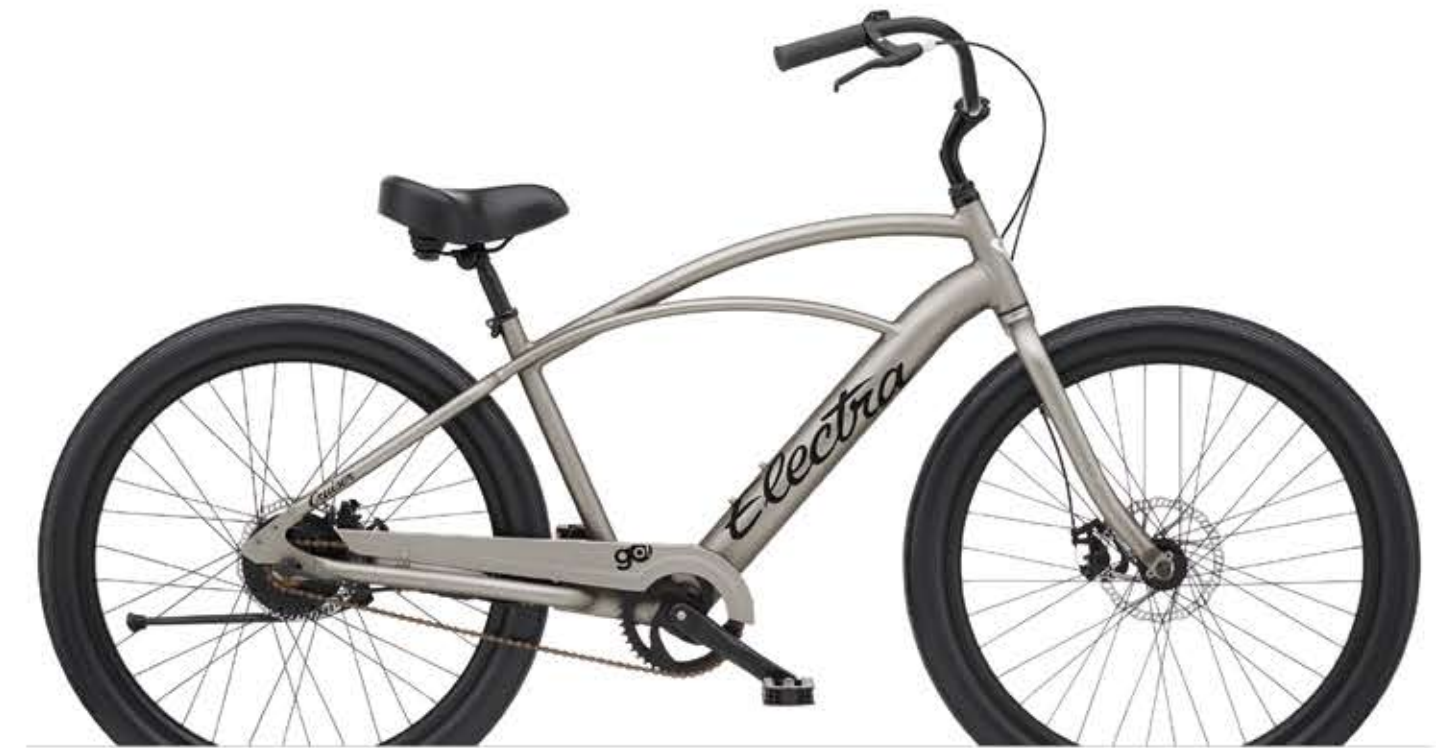
CRUISER GO! STEP-OVER / MATTE TITANIUM / SINGLE-SPEED / 5272067