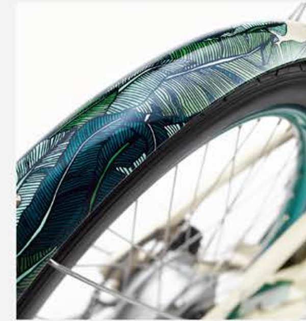
PAINTED FENDERS w/MATCHING GRAPHICS

Inspired by the lush tropical rain forests and jungles of the island, the Bali Go! features varying shades of rich metallic green leaves throughout the e-bike's design. Complimented by a cream-coloured frame inspired by white sandy beaches, the look is complete with a custom debossed saddle and grips, and matching bell.