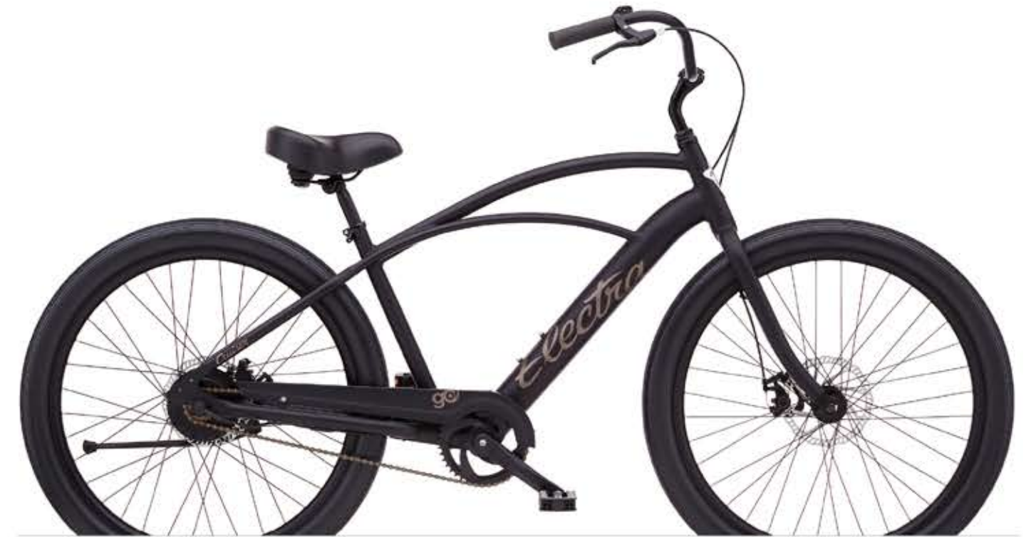
CRUISER GO! STEP-OVER / MATTE BLACK SAND / SINGLE-SPEED / 5272066