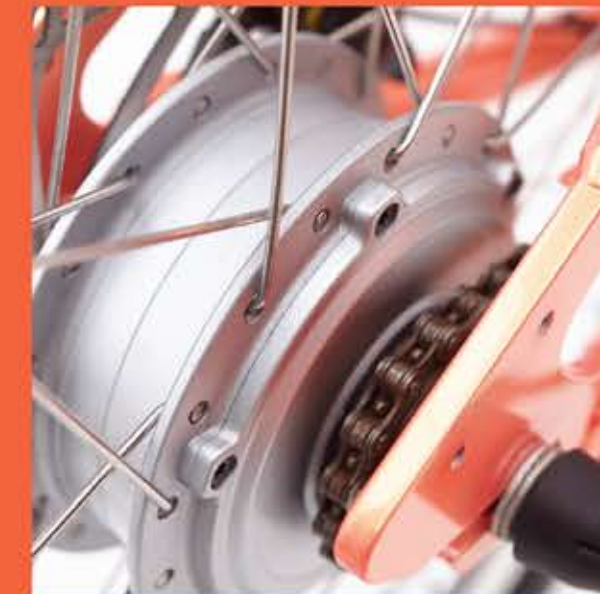
HYENA REAR HUB MOTOR w/SINGLE-SPEED DRIVETRAIN