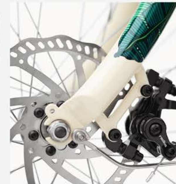
MECHANICAL FRONT AND REAR DISC BRAKES