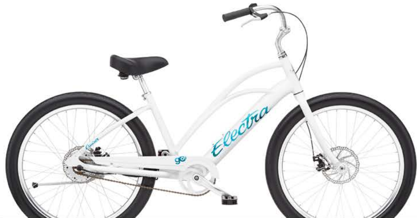
CRUISER GO! STEP-THRU / WHITE / SINGLE-SPEED / 5272071