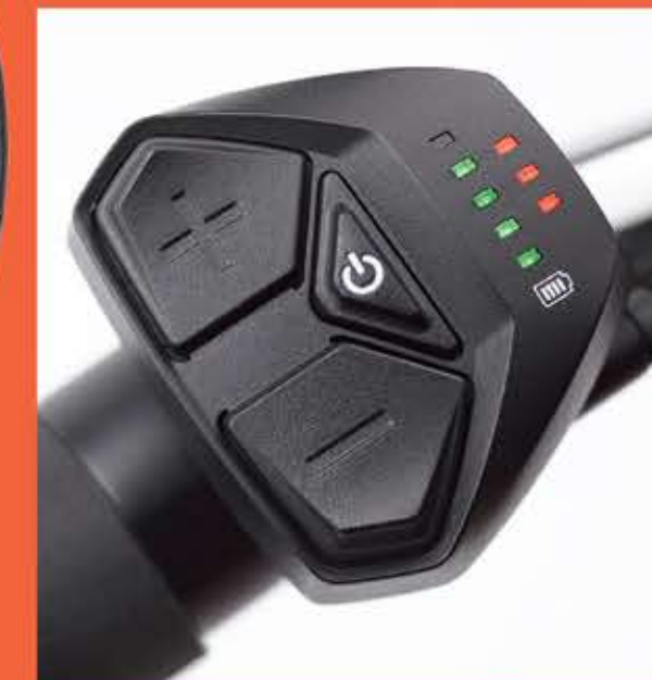
HYENA LED DISPLAY