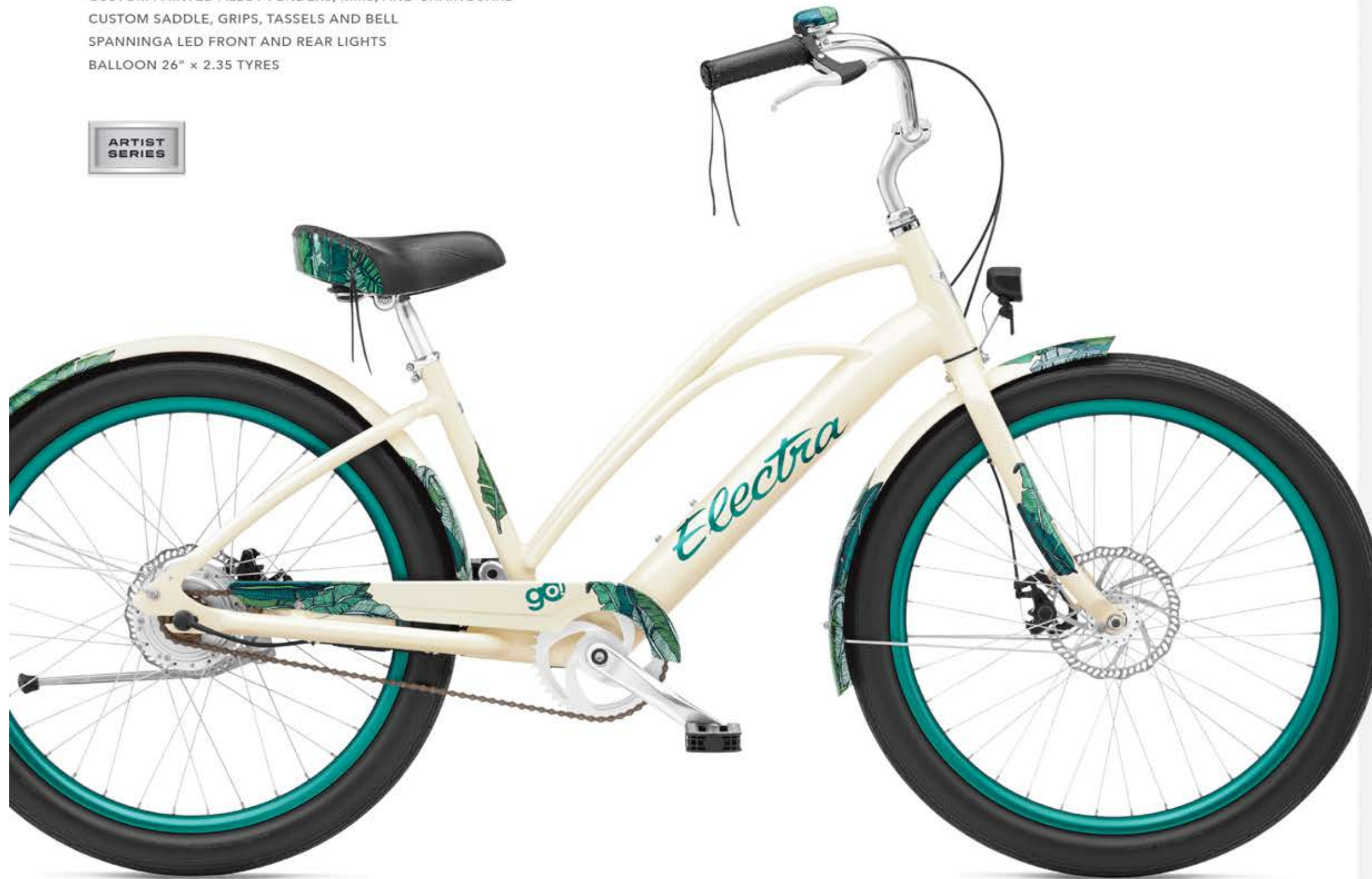
BALI GO! STEP-THRU / SAND / SINGLE-SPEED / ARTIST SERIES / 5272073