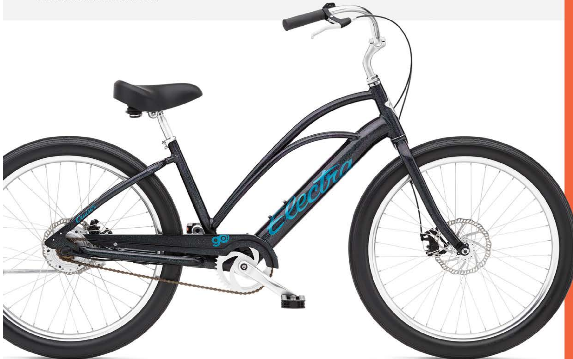
CRUISER GO! STEP-THRU / GALACTIC BLACK / SINGLE-SPEED / 5272069

6061-T6 ALUMINUM FRAME w/PATENTED FLAT FOOT TECHNOLOGY® HYENA FULLY INTEGRATED BATTERY SYSTEM HYENA REAR HUB MOTOR w/SINGLE-SPEED DRIVETRAIN MECHANICAL FRONT AND REAR DISC BRAKES BALLOON 26" x 2.35 TYRES (STEP-THRU) BALLOON 27.5" x 2.35 TYRES (STEP-OVER)